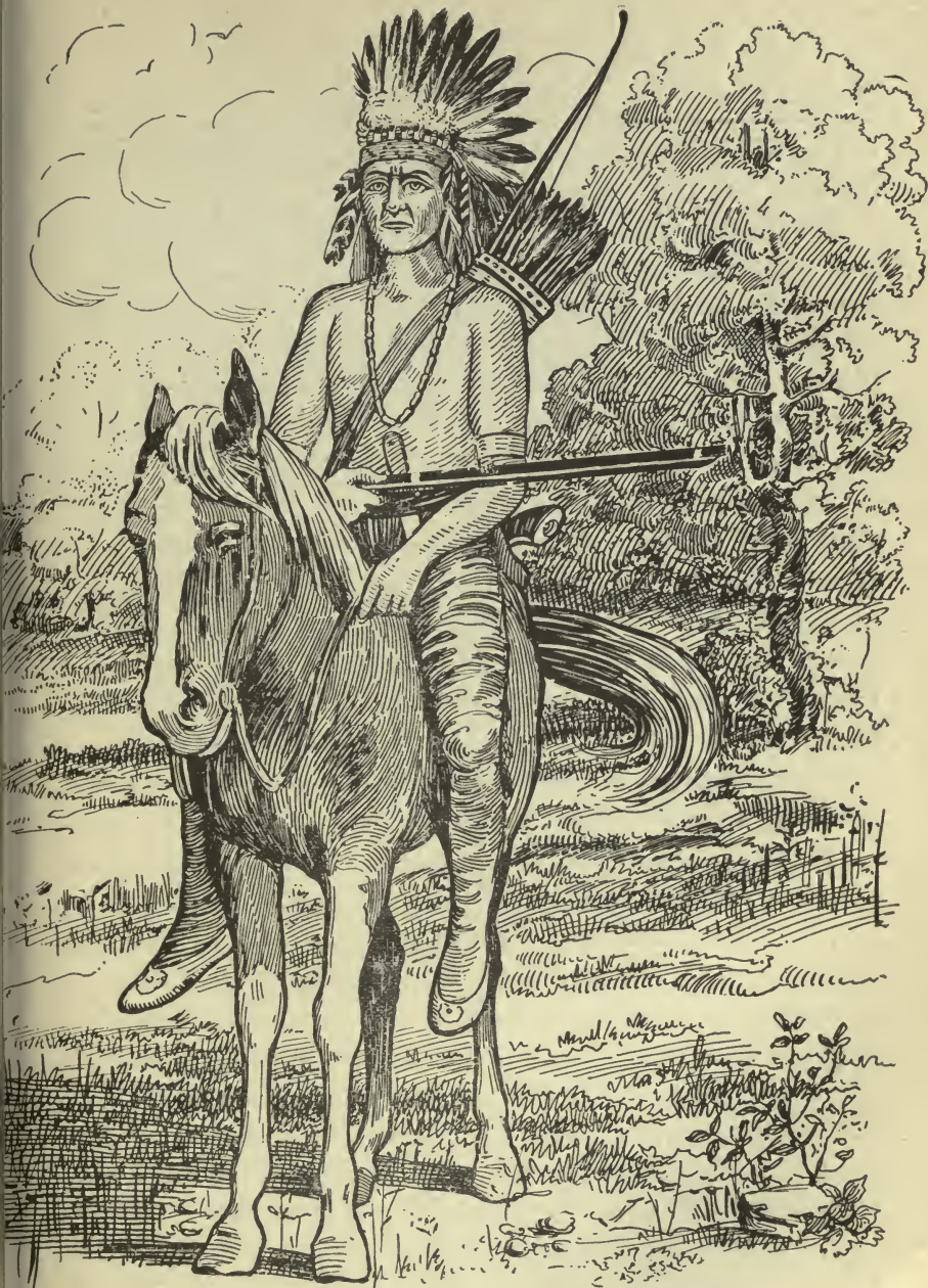
BIG FOOT, THE NOTED KIOWA CHIEF